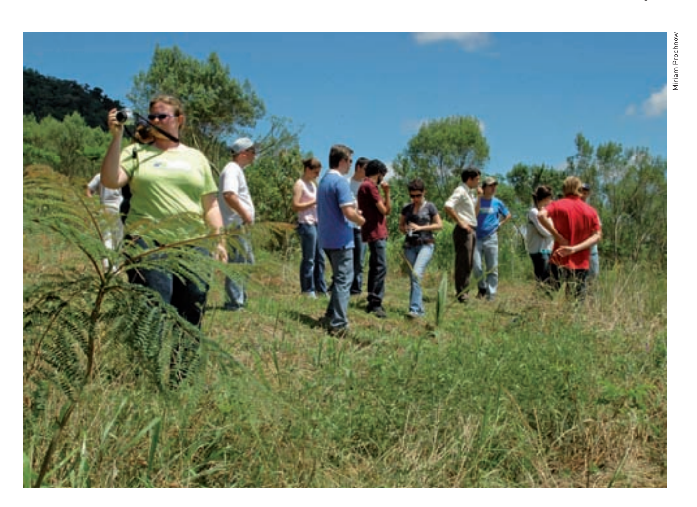
FIELD VISITS HELP TO DEVELOP GUIDELINES.

From the beginning of the Klabin's Forestry Incentive Program (tree farming program) to the end of December 2009, there have been distributed 166 million seedlings