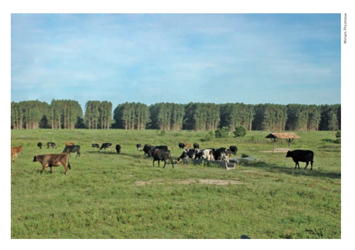
TREE FARMING PROPERTY IN BAHIA, THE GOAL IS TO DIVERSIFY.

in the two states, benefiting 18,000 tree farmers in 79 municipalities, resulting in 94,000 hectares of cultivated forests. To access the benefit, the applicant must comply with the environmental and labor laws. All participating companies of the Paraná and Santa Catarina Forests Forum have committed to implementing the established guidelines, taking as starting point a wide dissemination to the tree farmers.