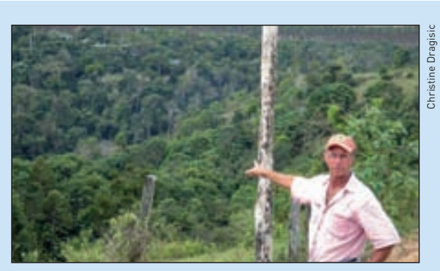
TREE FARMING PROGRAM BENEFITS GOOD PRODUCERS.

Whenever I can, I tell this to my friends and neighbors. Some of them have already started to preserve and restore