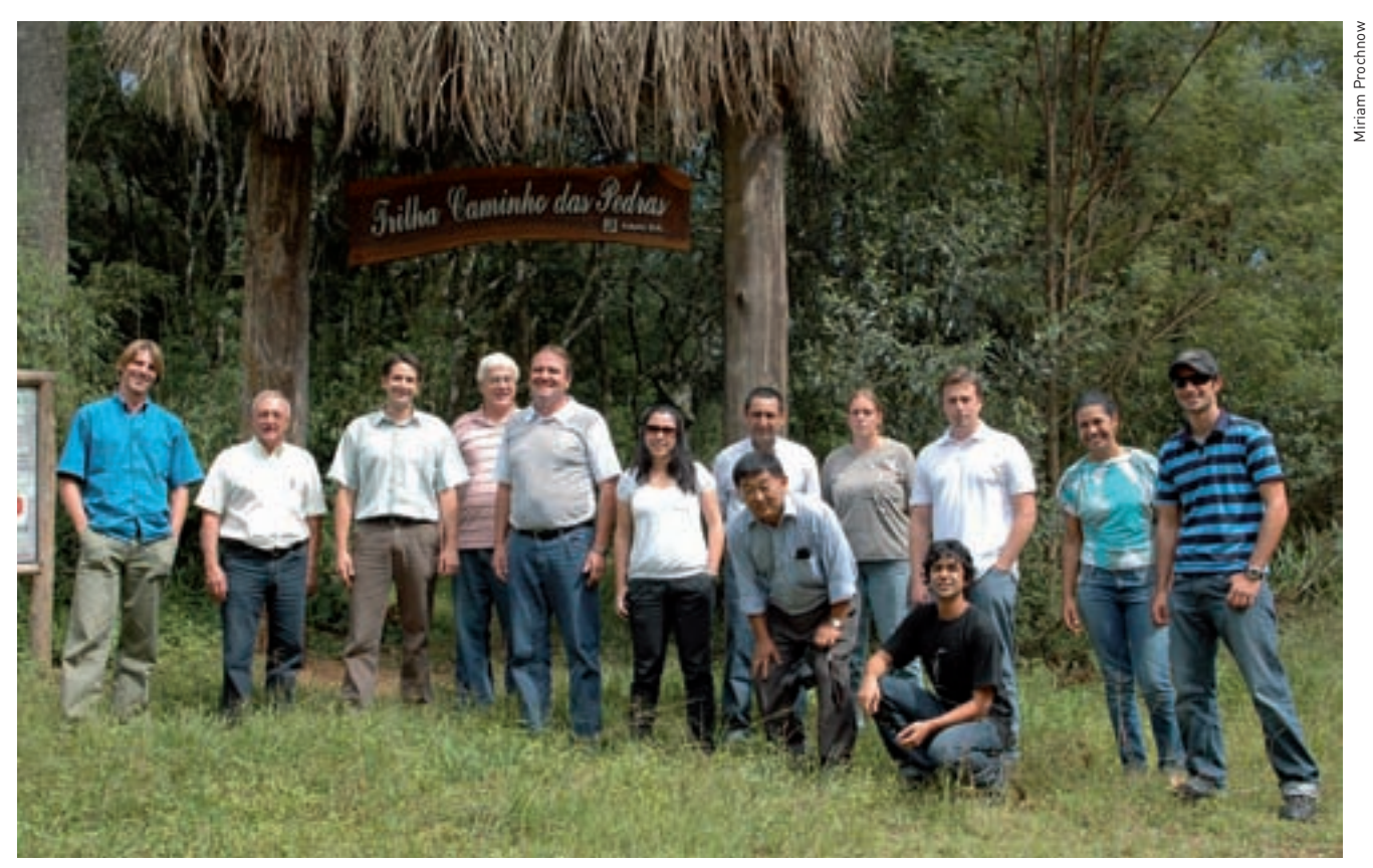
PARANÁ AND SANTA CATARINA FORESTS FORUM VISITING AN ECOLOGICAL PATH IN CACADOR (SC).