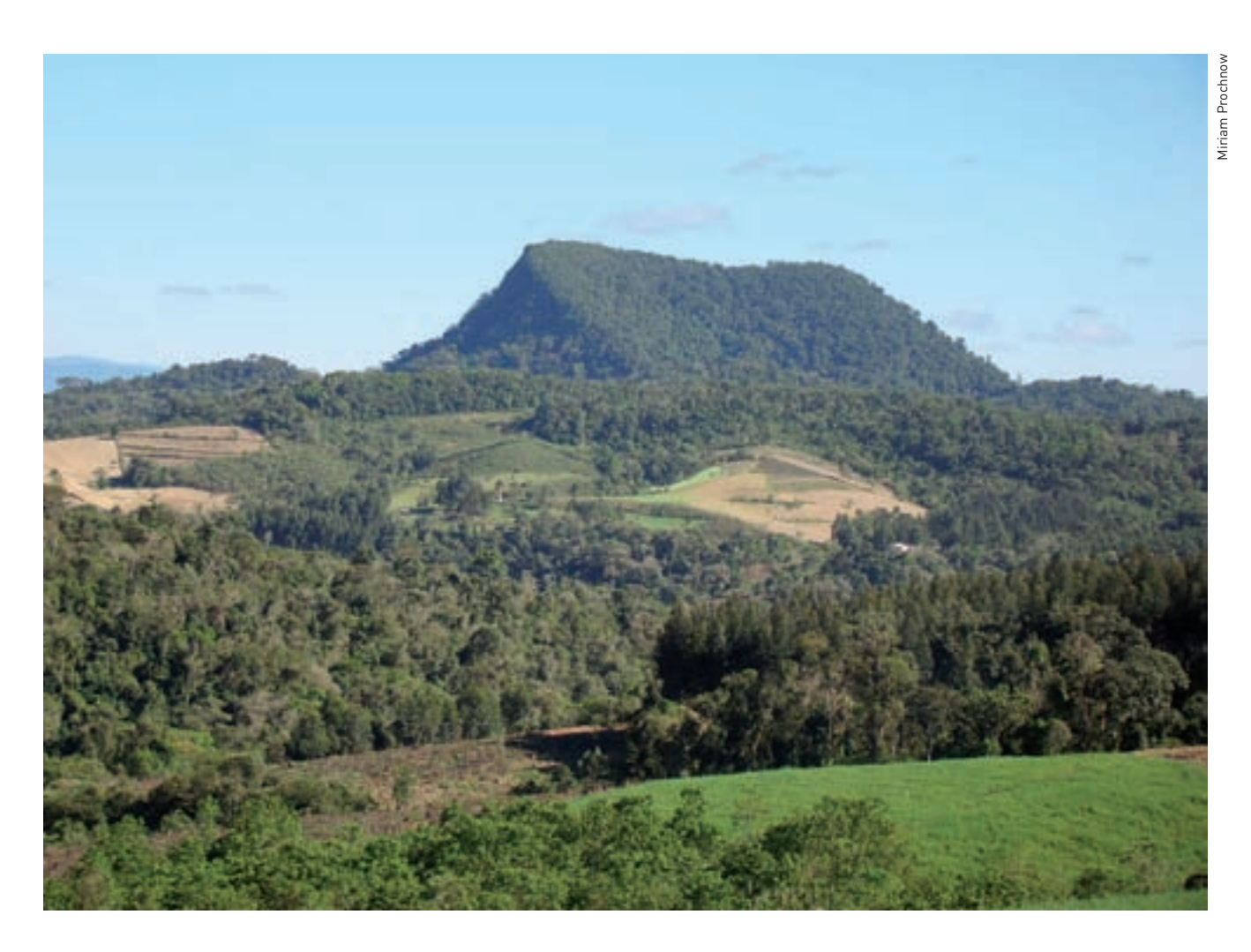
INFORMATION ON THE ATLANTIC FOREST IS PASSED ON THROUGH SEMINARS.

During the seminar, a number of lectures addressed topics such as the Forests Dialogue and the Atlantic Forest Restoration Pact<sup>4</sup> as essential tools for integration between NGOs, companies, governments and research institutions in the conservation and restoration of the Atlantic Forest; forest legislation and the relation between the planting of exotic forests and the water balance of river basins; practicable modalities of payment for environmental services (PSA) such as forest easement and the Ecological ICMS; and the importance of forest certification: steps and criteria to be followed.