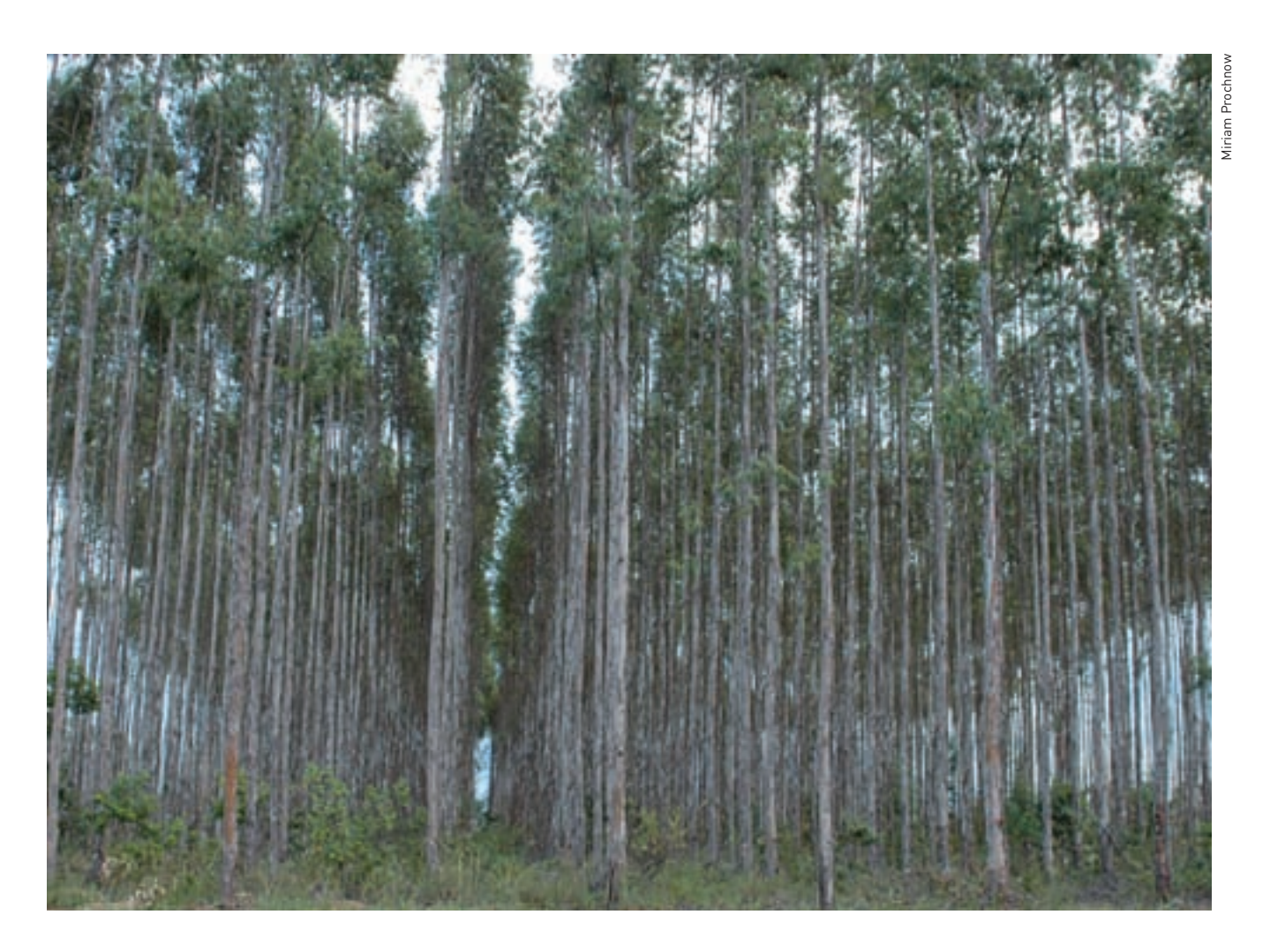
THE DIALOGUE SEEKS AGREEMENTS TO MINIMIZE THE IMPACT OF MONOCULTURE.

South of Bahia Forests Forum, the Captaincy of Ports of Porto Seguro, Veracel and Norsul (the company responsible for the maritime transport), considering the arguments and seeking agreement and approval from each institution or legitimate representative. "As an immediate result, the company changed the route that was originally eight miles far from the coast to 10 miles, but there are ongoing joint studies and projects with the local fishermen to improve the situation", explains the Manager of Sustainability at Veracel.