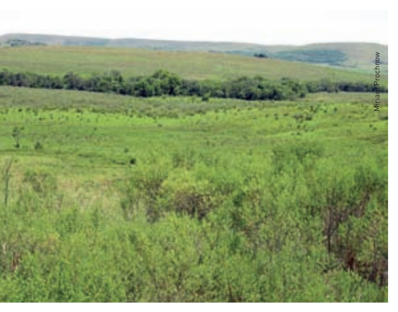
A STUDY HAS INDICATED PRIORITY PROTECTED AREAS TO RECEIVE ENVIRONMENTAL COMPENSATION FUNDS.

CMPC Celulose Riograndense has hired a team to diagnose important areas within its expansion program