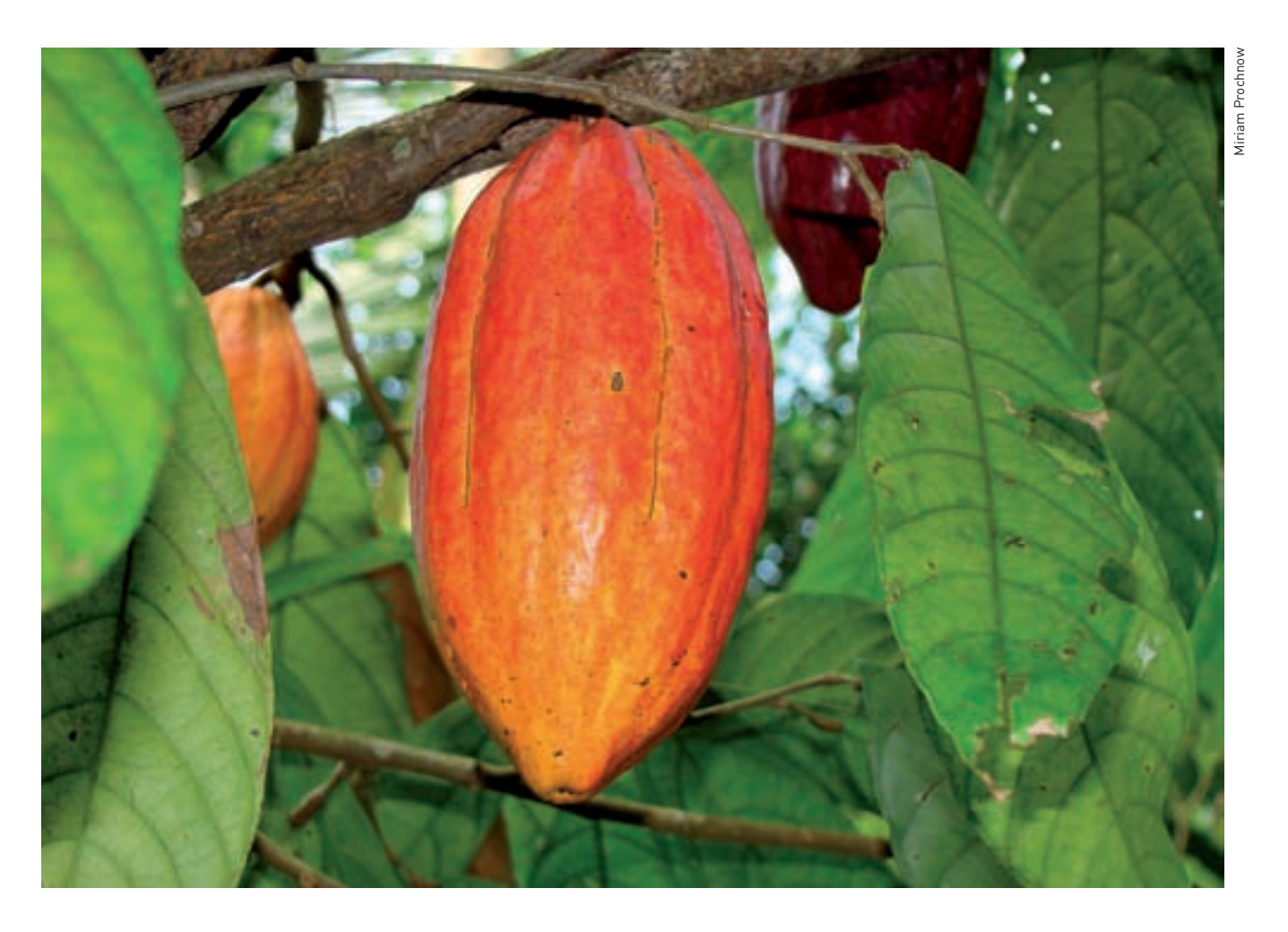
AGREEMENT PROTECTS CACAO CABRUCA CROP.

decided to withdraw the plantation areas from the village and occupy the free areas with family farming", she adds.