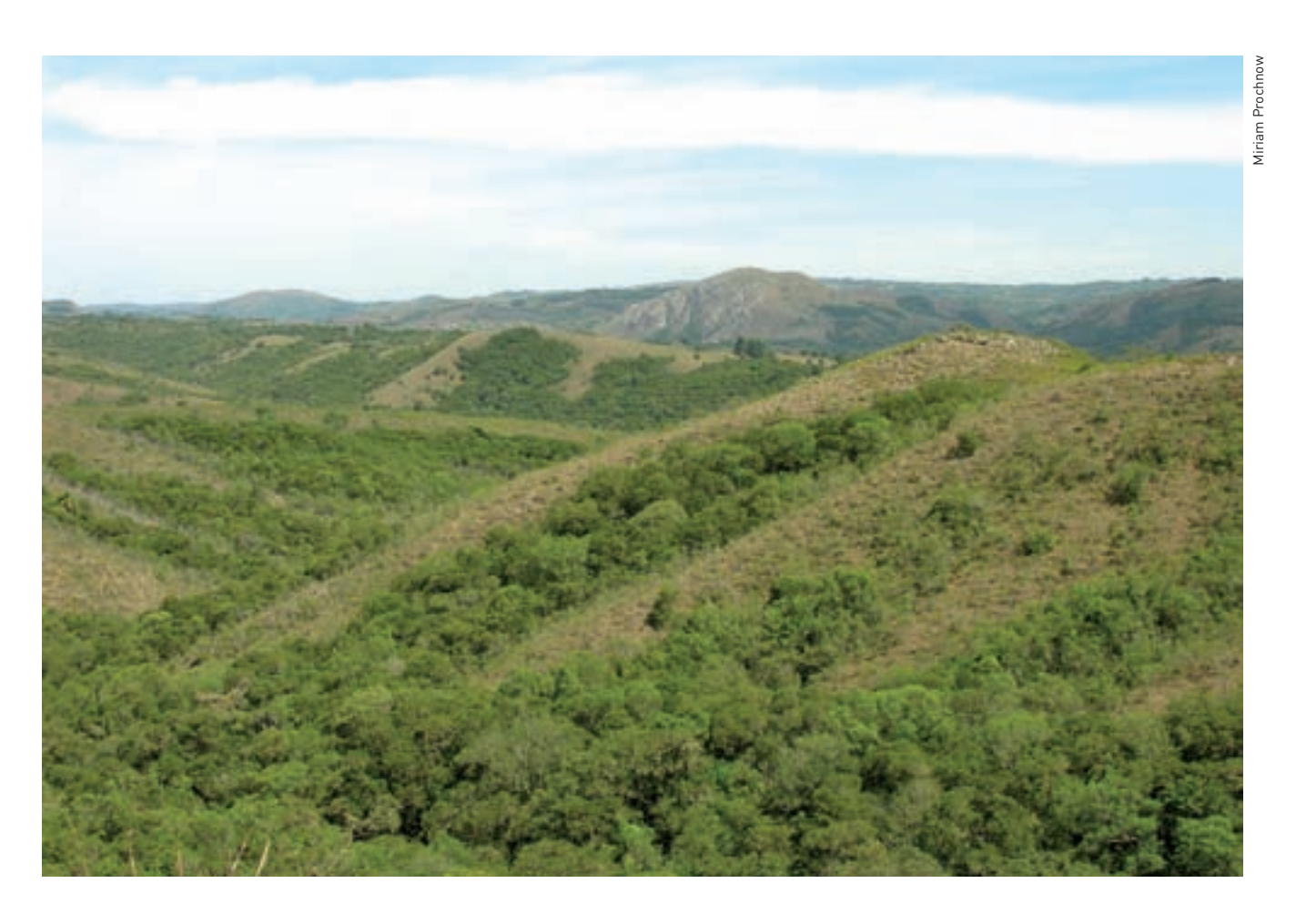
COMPANIES WANT FUNDS TO BE USED TO CREATE AND IMPLEMENT PROTECTED AREAS.

fauna threatened with extinction. In this region, located in the Extreme South of the State, there is not a single Protected Area of Integral Protection effectively implemented among the existing ones: Taim Ecological Station, Mato Grande Biological Reserve (Rebio), Camaquã State Park, Farroupilhas Municipal Park; RPPNs (Private Natural Heritage Reserves) Curupira, Pontal da Barra, Estância Santa Rita, Minas do Paredão and Torrinhas.