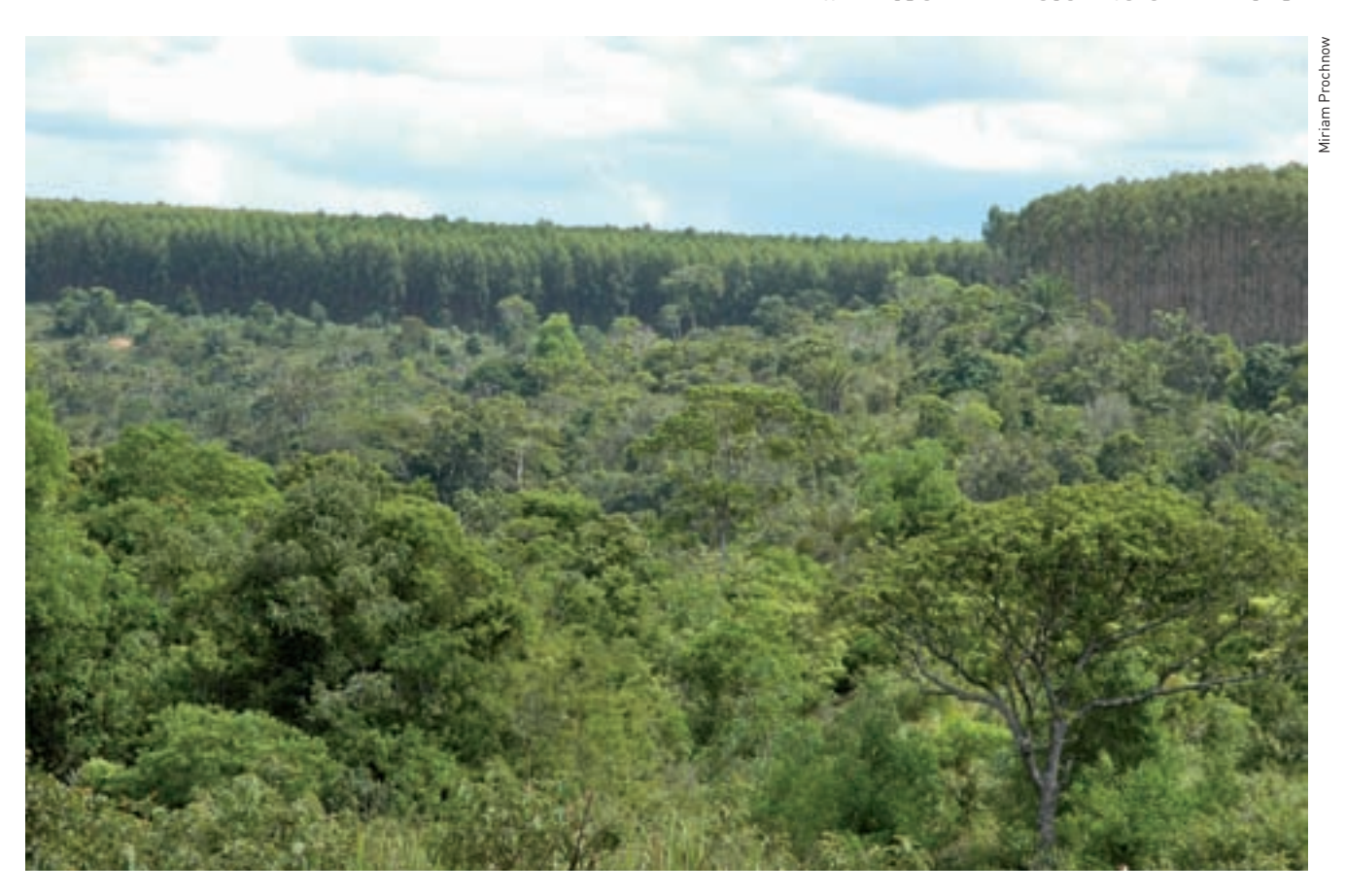
TALKING ABOUT REALITY AND PROPOSING CONCRETE ACTIONS FOR THE INTEGRATION OF ENVIRONMENTAL CONSERVATION AND FORESTRY IS ONE OF THE GOALS OF THE FORESTS DIALOGUE.

to be used as a source of energy in different economic activities, particularly in steelmaking.