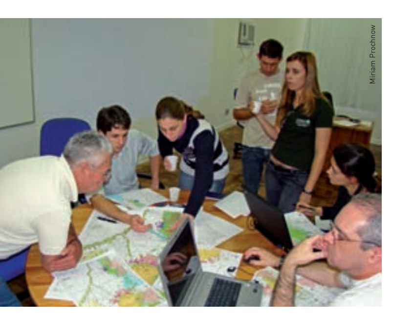
PARANÁ AND SANTA CATARINA FORESTS FORUM DISCUSSING THE AREA OF THE PILOT PROJECT.

These municipalities were selected during the meetings of the Forum and observed the following criteria: Permanent Preservation Areas (APPs) existing in the municipality and waiting to be restored, areas of the forestry sector and NGO activities in these municipalities, relevant forest remnants and deforestation rate according to data from 2008, SOS Mata Atlântica/Inpe¹, and native priority areas indicated by Probio² in 2006.